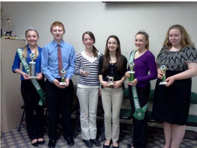
Equestrian of the Year Contestants